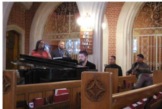
Guest Musicians: Stabe Wilson Band