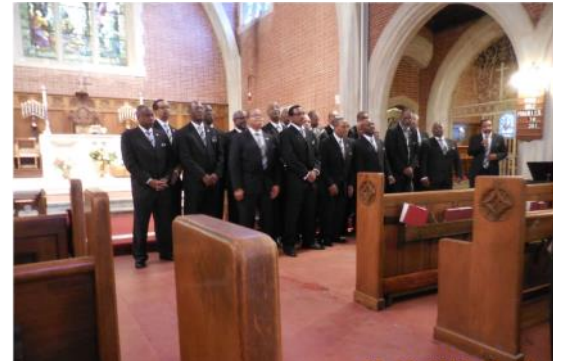
Guest Choir: Allen Temple Men's Chorus