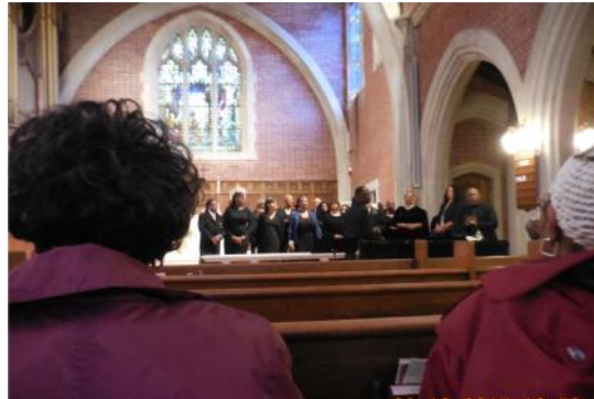
Guest Choir: African Methodist Episcopal Choir