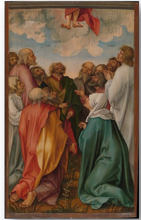
The Ascension. Hans Süss von Kulmbach, 1513. The Metropolitan Museum of Art, New York, N.Y.

Almighty God, whose blessed Son our Savior Jesus Christ ascended far above all heavens that he might fill all things: Mercifully give us faith to perceive that, according to his promise, he abides with his Church on earth, even to the end of the ages; through Jesus Christ our Lord, who lives and reigns with you and the Holy Spirit, one God, in glory everlasting. Amen (Book of Common Prayer, p. 226).